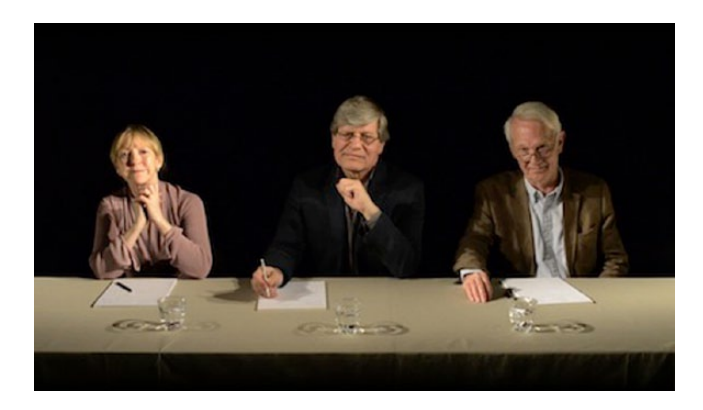
Figure 2b. Still of the virtual audition panel.

provided, followed by listening behaviours similar to those of a typical Western classical performance (e.g. naturalistic body swaying and discrete fidgeting and movement). For the audition panel, a neutral introduction was given (i.e. "Hello, please start whenever you are ready"), followed by typical evaluative behaviours such as making notes and leaning back while simultaneously portraying a neutral facial expression. After the performance, the audience applauded politely, while the audition panel gave a polite but noncommittal "Thank you very much". The order of the two performances was counterbalanced, and all performances were audio and video recorded for the participants' own use.