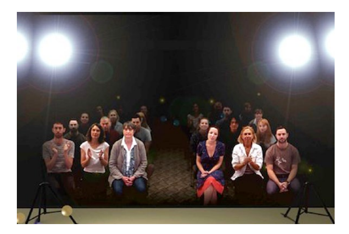
Figure 2a. Still of the virtual audience.